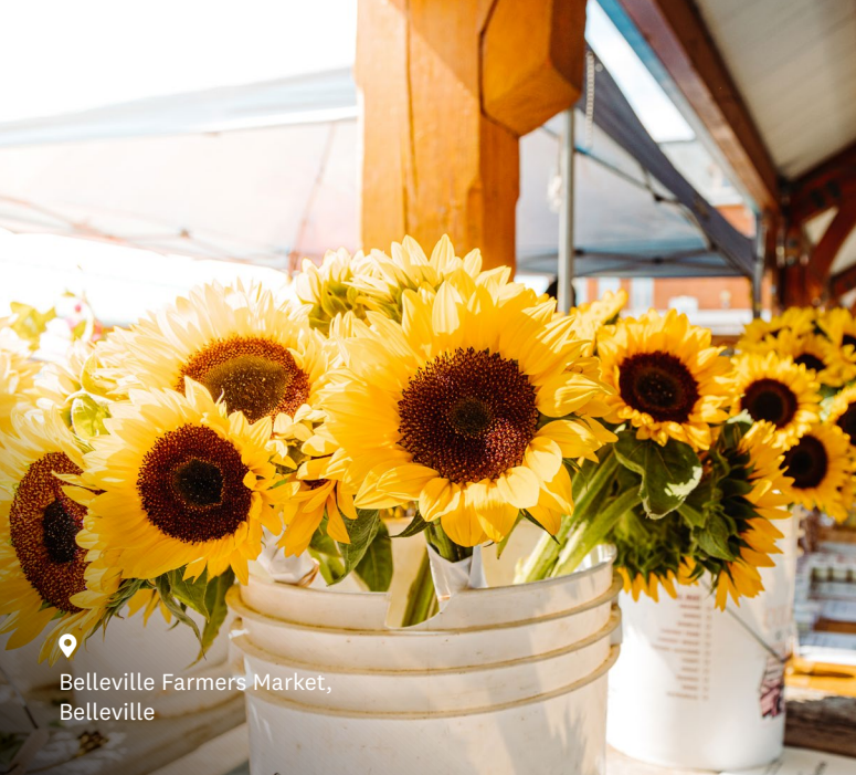
Belleville Farmers Market, Belleville