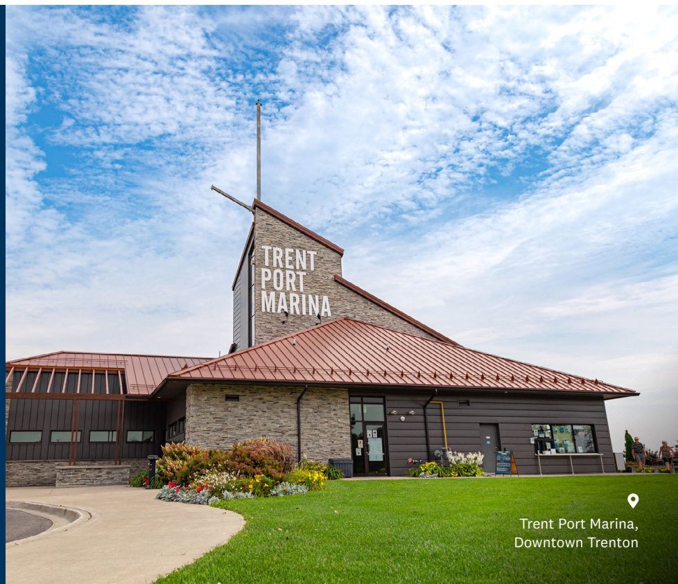
Trent Port Marina, Downtown Trenton

Bay of Quinte – West – Cycling Itinerary