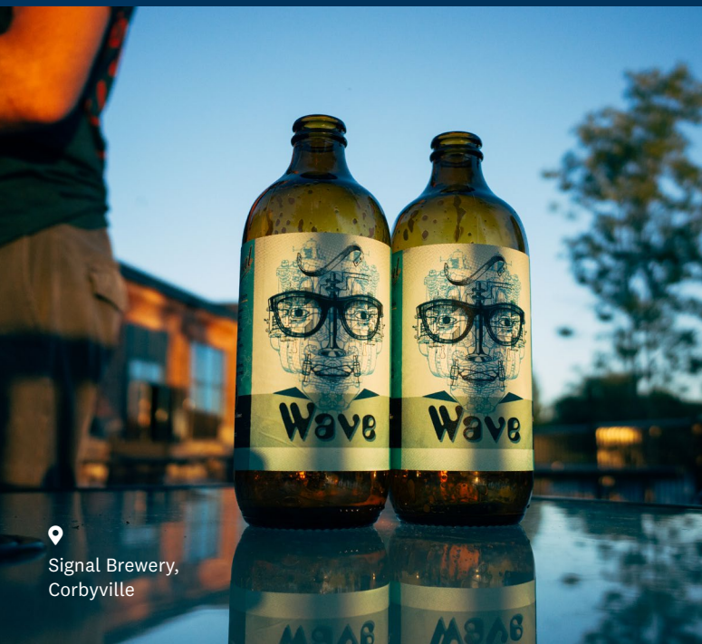
Signal Brewery, Corbyville