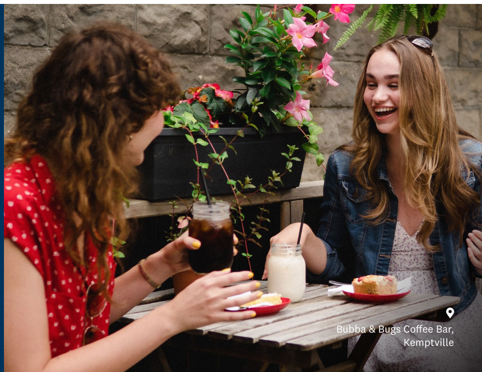
Bubba & Bugs Coffee Bar, Kemptville

Rideau Canal Waterways East: Kemptville, Merrickville, Jasper – Cycling Itinerary