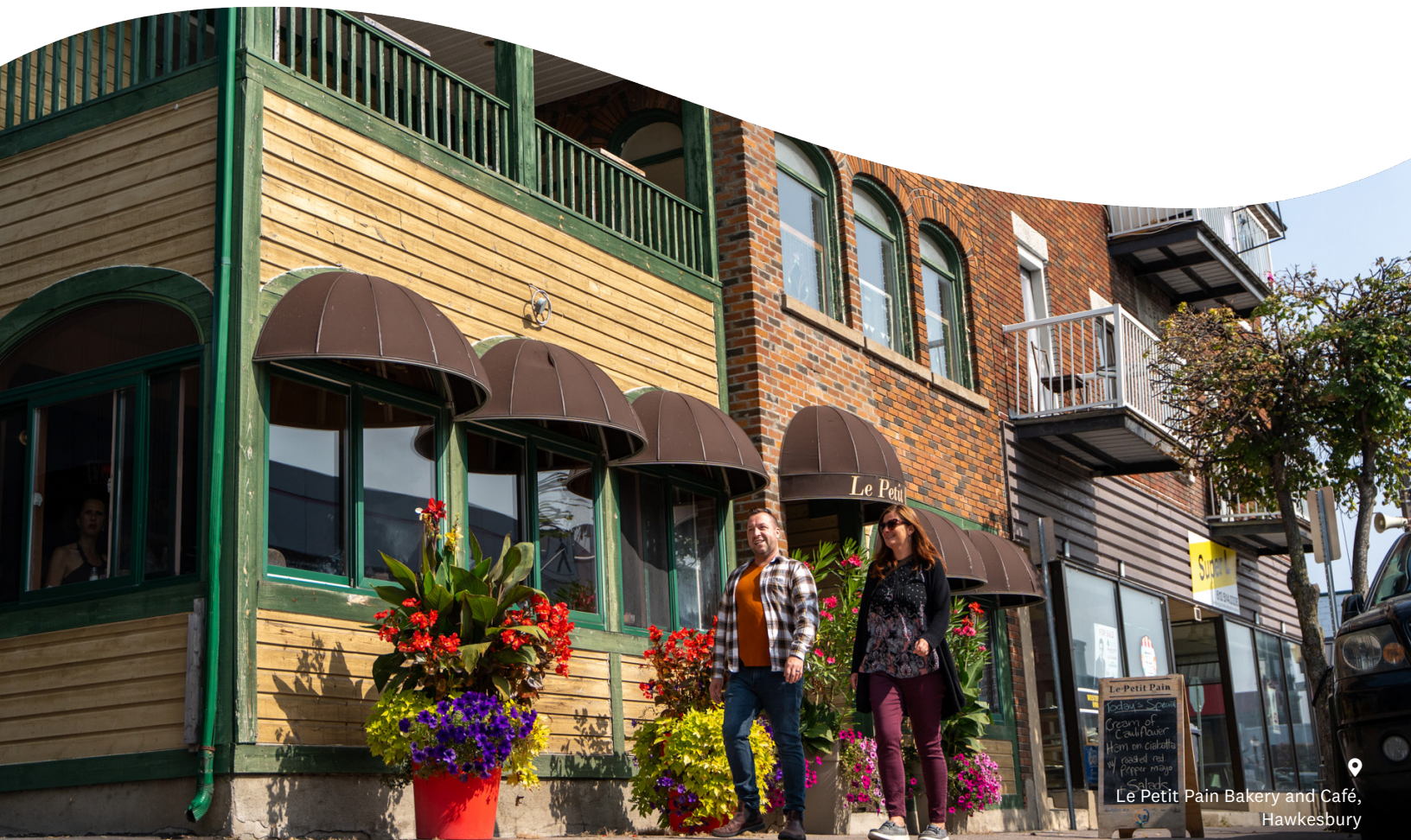
Le Petit Pain Bakery and Café, Hawkesbury